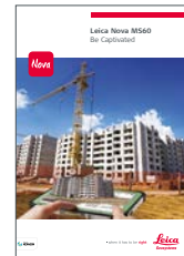
Leica Nova MS60